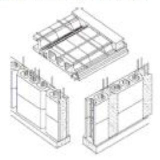
Figure 4.10. Zip block system

Zipbloc system- This system developed in India, utilizes a single precast element, a hourdi-type hollow block 530 × 250 × 140 mm for walls and roofs.